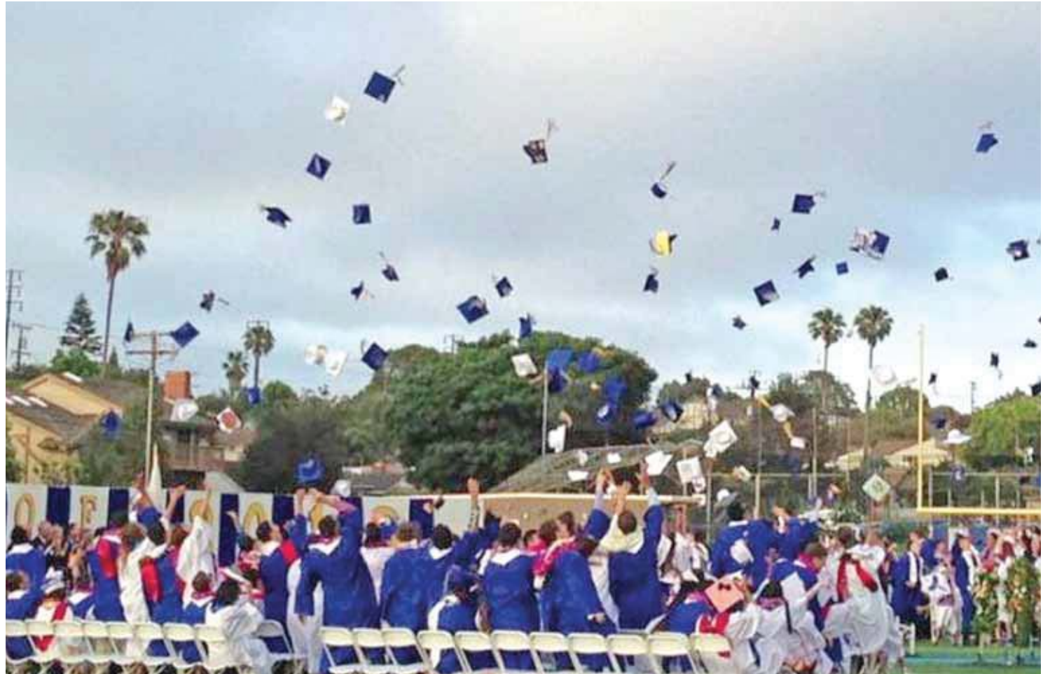
Graduates, at a local South Bay graduation, show their jubilation and throw their caps in the air in celebration of their milestone.